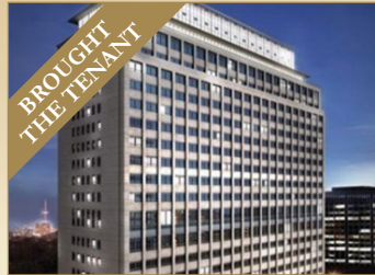
ST. CLAIR WEST

At stylish Art Shoppe. Courtyard-quiet comes standard in this 1 bedroom plus den. Successfully leased with rapid occupancy in a competitive market.