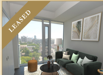
YONGE & EGLINTON

Art Shoppe condo boasts spectacular view from this big 1 bedroom plus den. Obtained 99% of asking rent for landlord client.