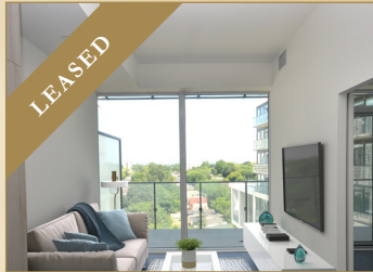
YONGE & EGLINTON

At stylish Art Shoppe. Courtyard-quiet comes standard in this 1 bedroom plus den. Successfully leased with rapid occupancy in a competitive market.