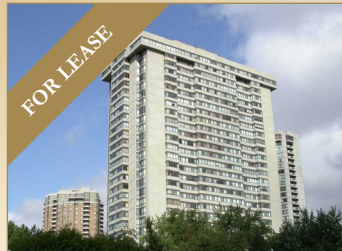
DON MILLS & FINCH

Art Shoppe condo boasts spectacular view from this big 1 bedroom plus den. Obtained 99% of asking rent for landlord client.